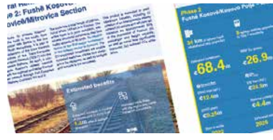
December 2022 Factsheet Rail Corridor R10, Kosovo Download here >>

September 2022 From Plan to Action - WBIF Key achievements 2021 Download here >>