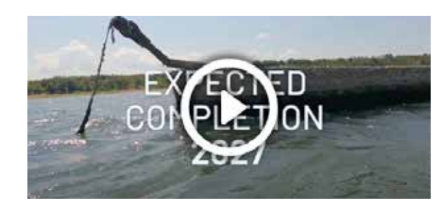
August 2022 Removal of WWII ships from Danube, Serbia Watch here >>

October 2022 Oslomej 1 Solar power plant, North Macedonia Watch here >>